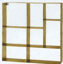
GOLD Bloomingville squares shelf in brushed gold: £349

Here's our pick of DIY chic storage, for a podium finish