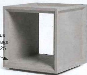
SILVER Lyon Beton concrete plus square storage module: £225