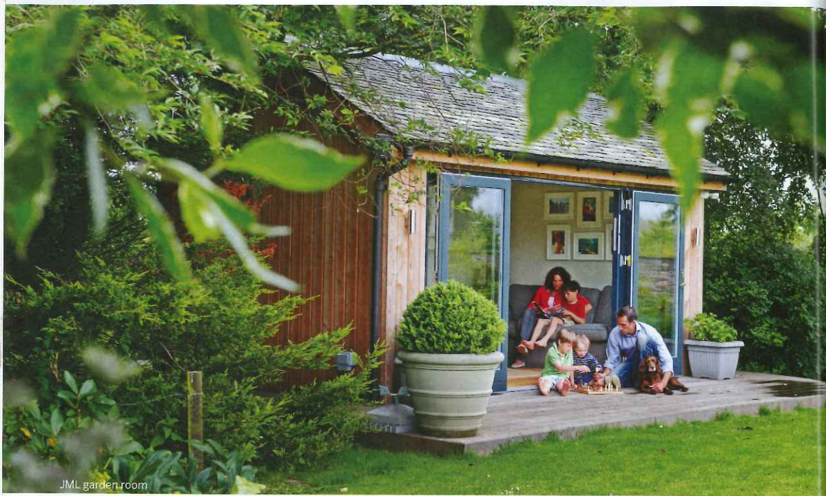
JML garden room

And while extensions can be costly, rest assured that even if you do sell your home, your efforts will add up to a good investment. As TV property expert Phil Spencer says, adding an extension can add 11 per cent to the value of your property.