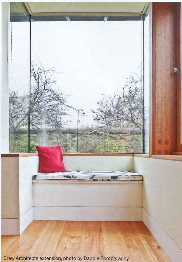
Crew Architects extension