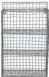
BRONZE Nkuku locker room shelf, distressed grey: £40