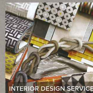
INTERIOR DESIGN SERVICE

Offering everything from classic to modern furniture, our stores have everything to help you create your own amazing space. Regardless of your budget or style, we are the home of inspiration.