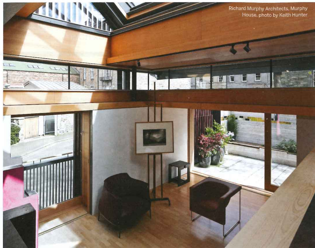
Richard Murphy Architects, Murphy House