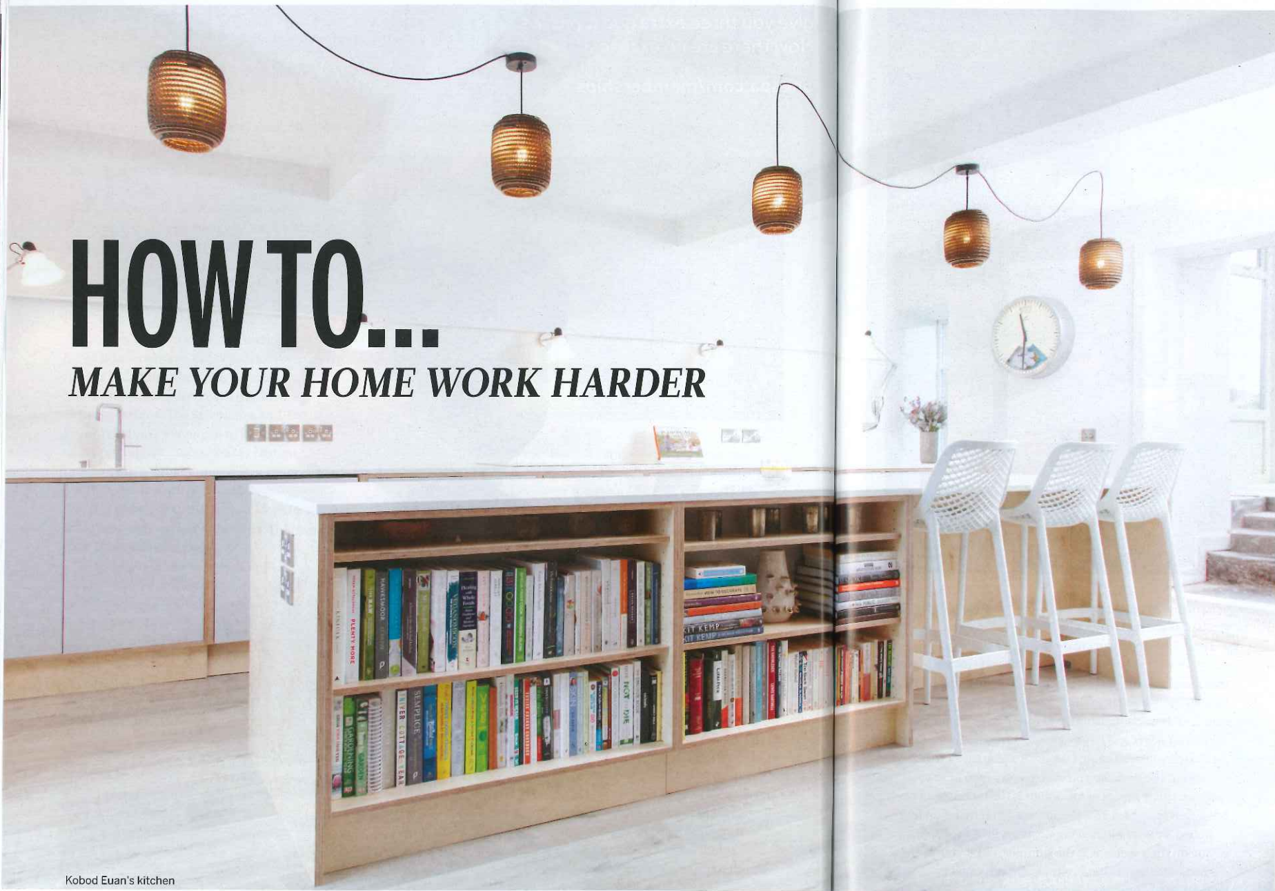
Kobod Euan's kitchen